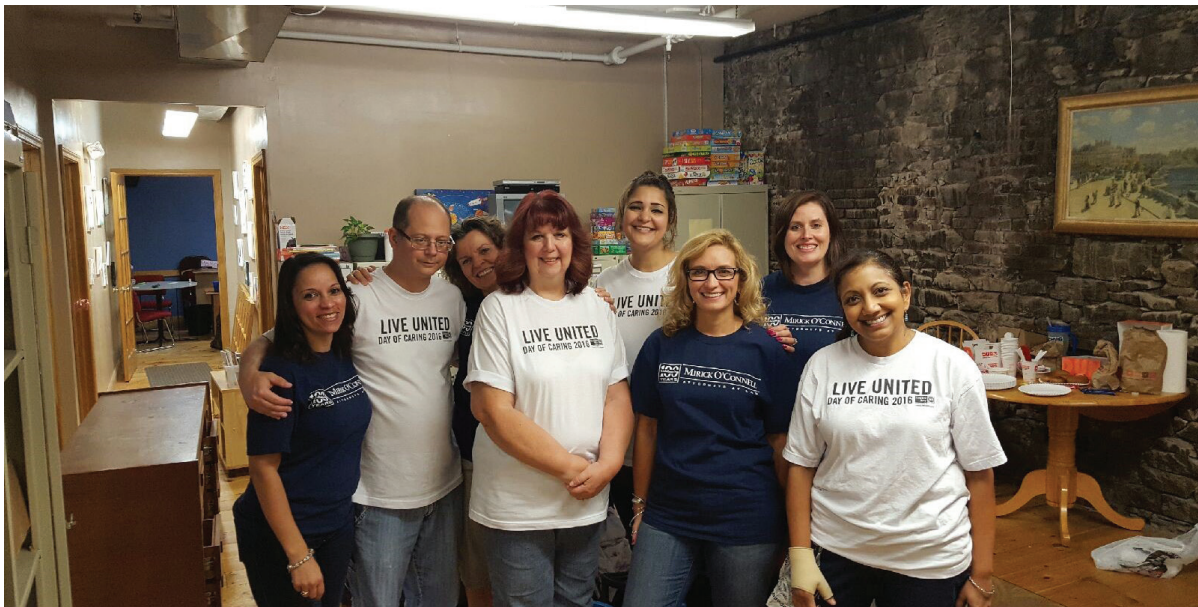
Reliant Medical and Mirick O'Connell - Day of Caring, Visitation Center

This data has been prepared for presentation prior to completion of the annual audit. When completed, copies of the audited financial statements will be available upon request.